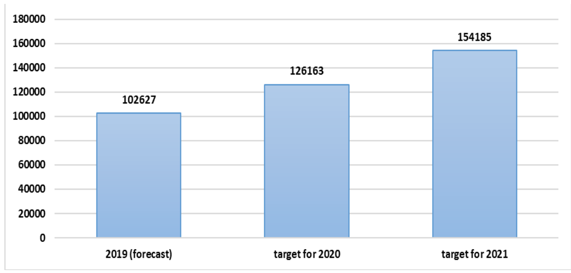
Picture 1. The State Budget revenues of Uzbekistan.

According to the State Budget parameters of the main macroeconomic indicators of the Republic of Uzbekistan for 2019, 2020 and 2021, the State Budget revenues will amount to 102.62 trillion sums in 2019 and for 2020 and 2021 years the State Budget revenues are planned 126.16 and 154. 185 trillion UZS respectively.