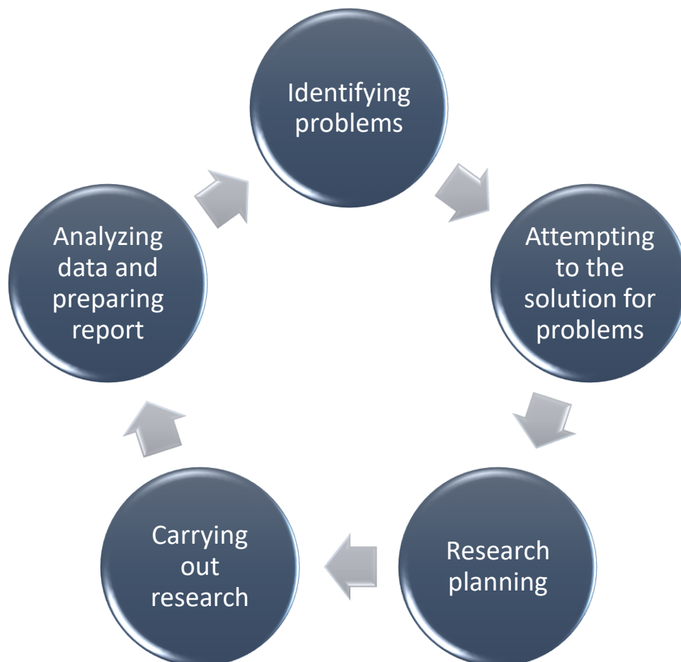
Figure 2. Process of Market Research.